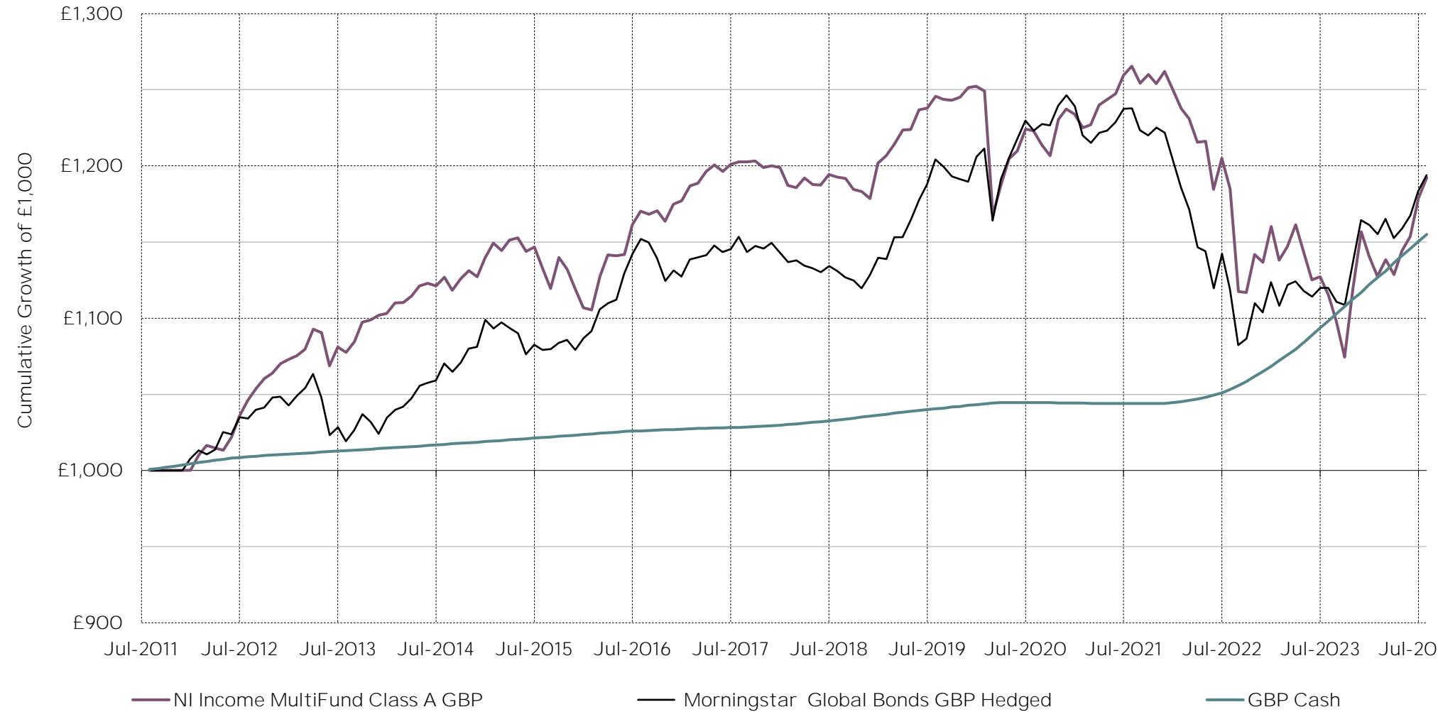
Class A GBP monthly returns and cumulative growth of £1,000

Past Performance is not indicative of future performance and does not predict future returns